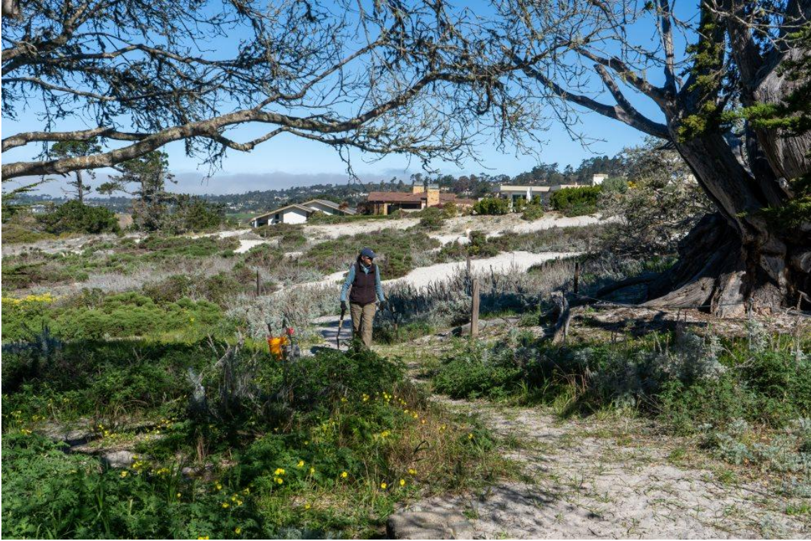
Biologist Joey Dorrell-Canepa (above) walks along a path with yellow-flowered oxalis waiting to be pulled.