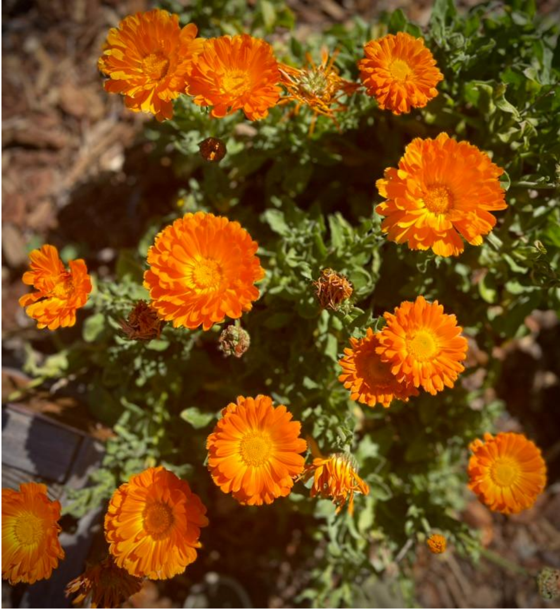
Barbara contributed a riot of orange - a patch of volunteer calendula in her vegetable garden.