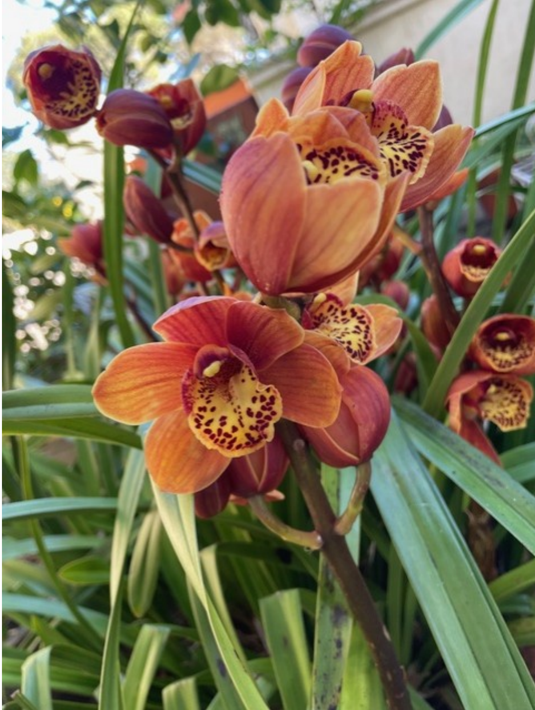
Lynn's beautiful rusty brown cymbidium orchid has thrived this winter, thanks to the mild weather conditions we've experienced.