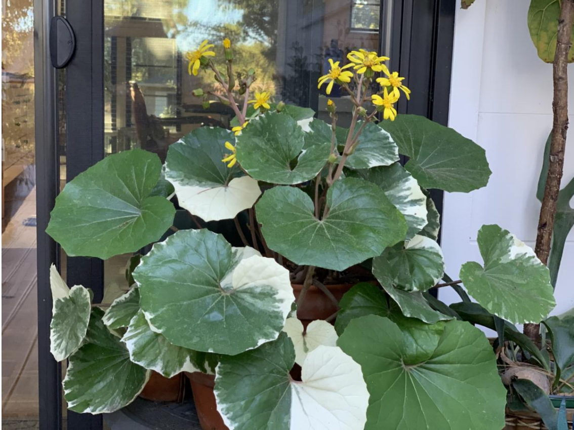
Gay's Ligularia is in bloom.