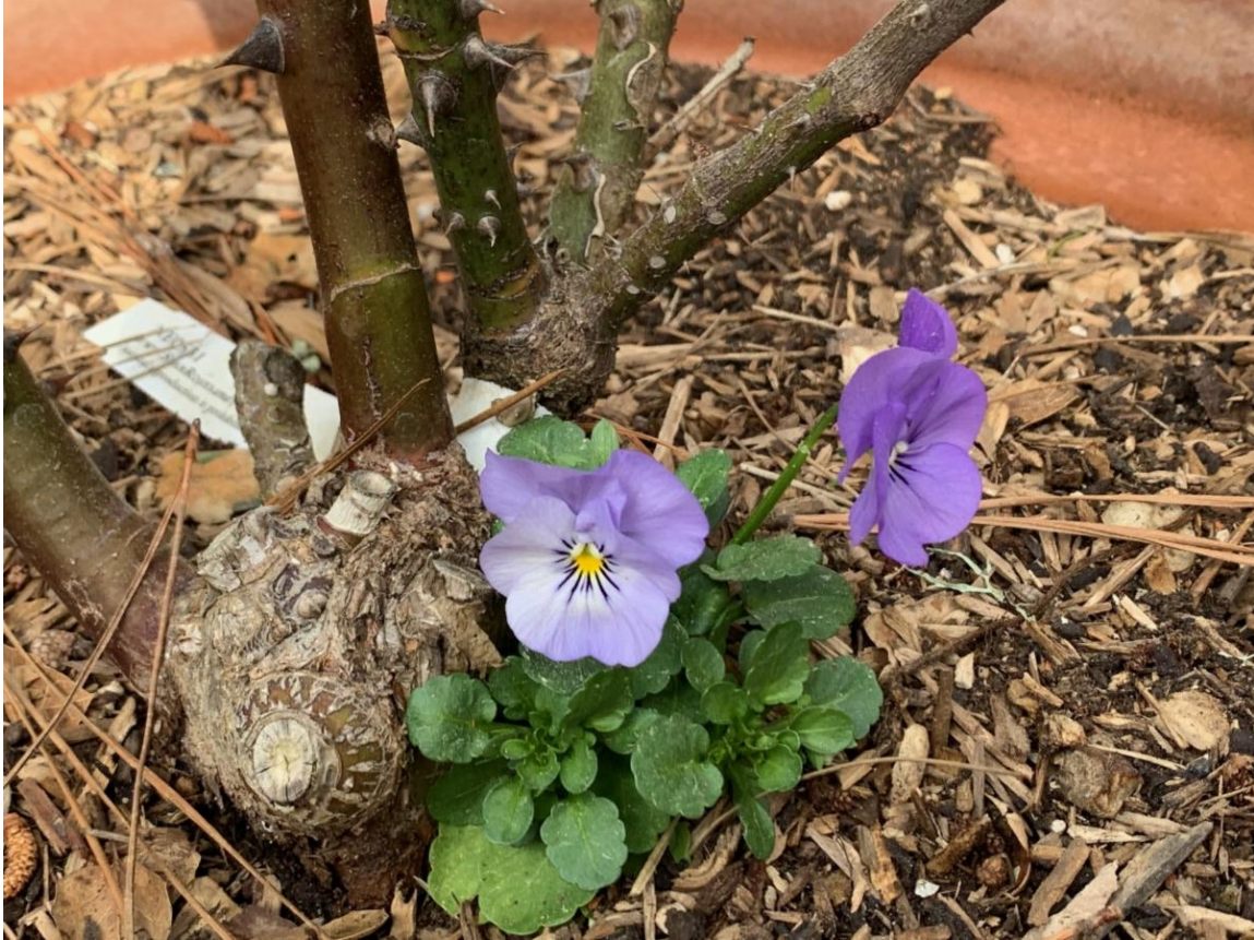
A volunteer viola showed up under Gay's potted rose - leaving her puzzled and charmed by its arrival.