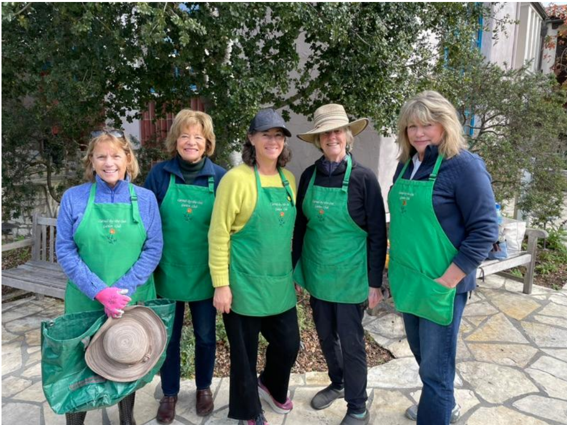
The small but mighty weeding crew on February 11th.