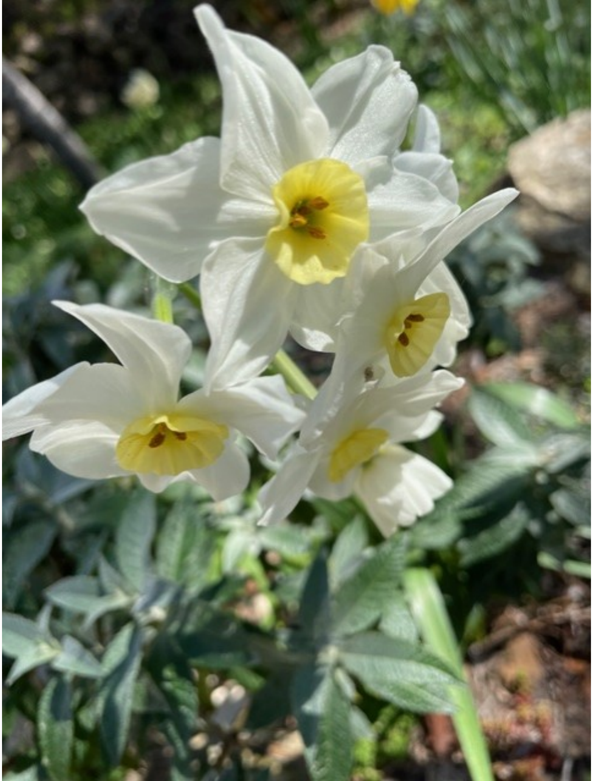
Spring's comes alive in Lynn's garden with vibrant narcissus blooms, while her delightful garden gnome (below) stands guard, adding a whimsical touch to the scenery.